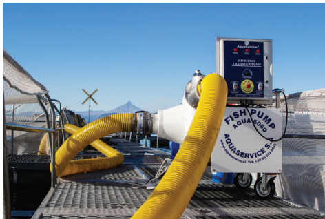
Designed to work with fresh water or salt water without suffering damage