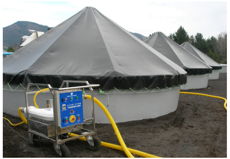
Electric pump working in tanks.