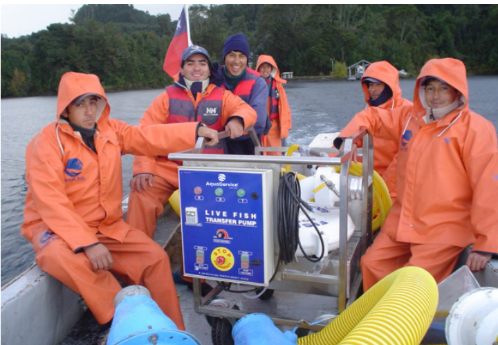
Easy to handle.