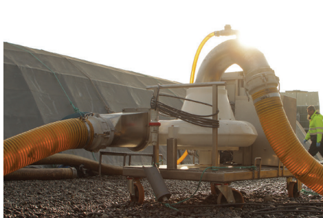
Constructed in stainless steel and alloy aluminium