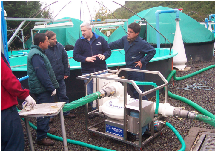
Installation and implementation of the machine.