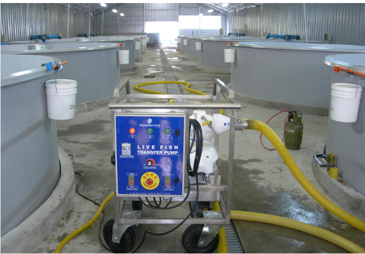
Electric Pump working in fish transferring operations.