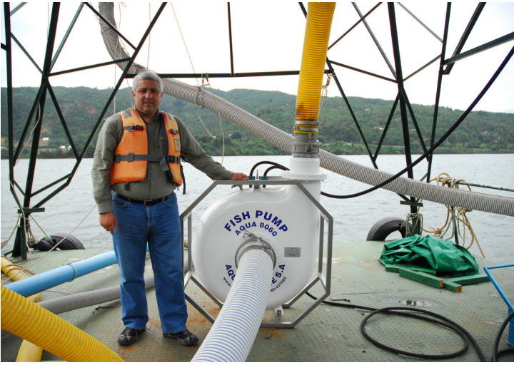
Hydraulic Pump inicial operation.